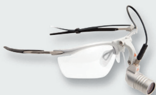
HEINE MicroLight 2 on S-FRAME

For those who need a compact, lightweight illumination solution without magnification, we offer the MicroLight 2. Featuring LED HQ illumination for homogeneous illumination with true and natural colour rendering for every examination situation. Two mounting options offer individuality and easy handling. Illumination without compromises, in a lightweight design.