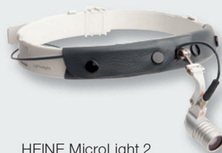
HEINE MicroLight 2 on Lightweight Headband