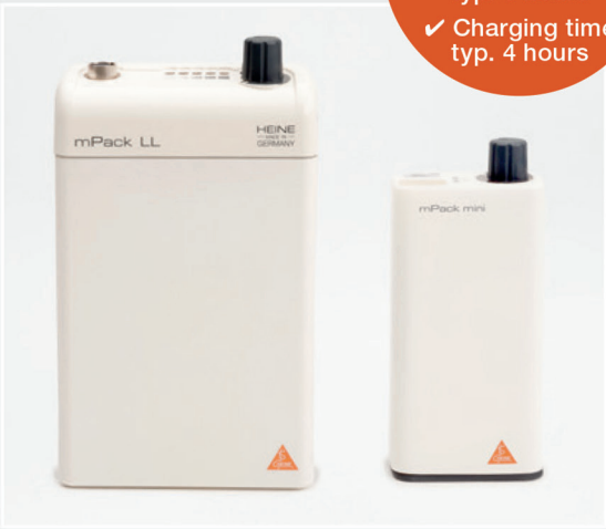
Size comparison of HEINE mPack LL/ mPack mini

NEW! ✓ 70% smaller and lighter ✓ Operating time typ. 9 hours ✓ Charging time typ. 4 hours